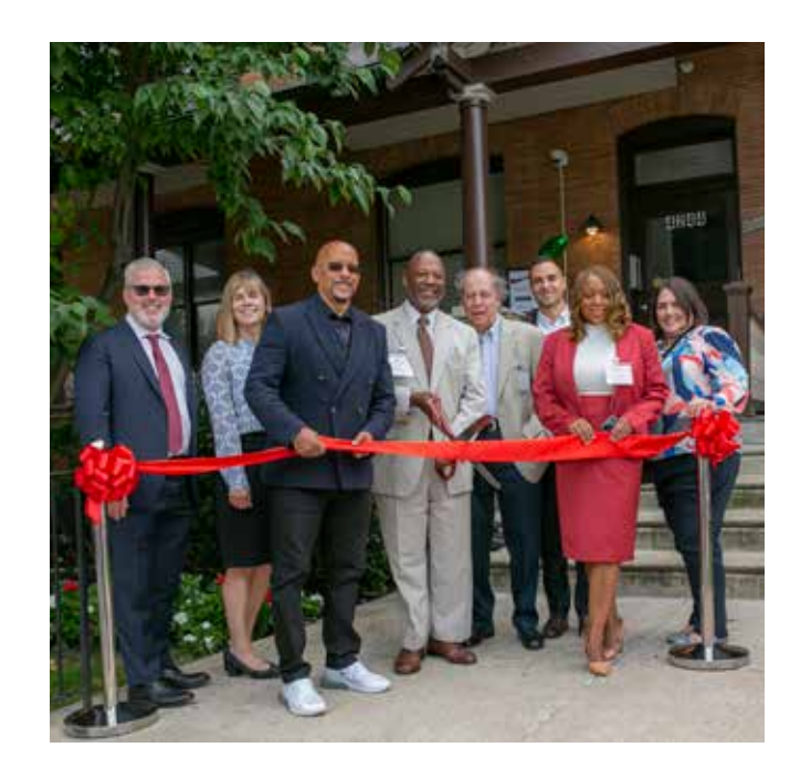
Mission First, alongside other members of the community and project team, at the ribbon cutting of 4244 Parkside Avenue.

In 2023, the Mid-Atlantic-based Mission First Housing Group completed the rehabilitation of the Parkside Neighborhood Preservation in Philadelphia using HTCs and low-income housing tax credits (LIHTCs). This was Mission First's second round of investment in these properties, which were initially rehabilitated in the early 2000s. This project consisted of the rehabilitation of 82 occupied apartments spread across 16 former single-family residences in the historically prominent Parkside neighborhood of West Philadelphia that overlooks Fairmount Park. The homes highlight Victorian-era architecture, complete with Roman brick, stone and copper features, including their highly prominent front porches.